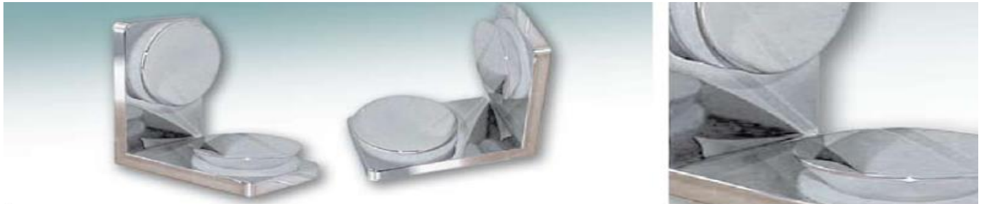
Bracket glass / glass 90° (screw system)